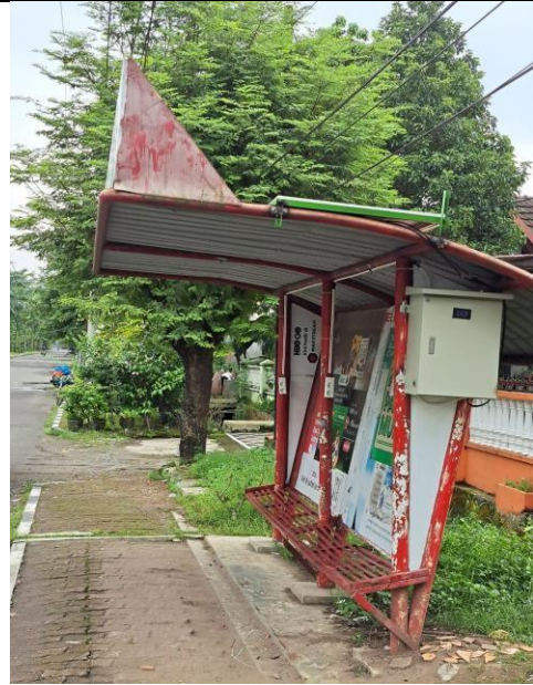
Solar Panel found in the Main Administration Building, Solar panel in Faculty of Engineering integrated Lab ,Class Room, Solar-powered lights along at Universitas Street and Solar charging at shuttle bus