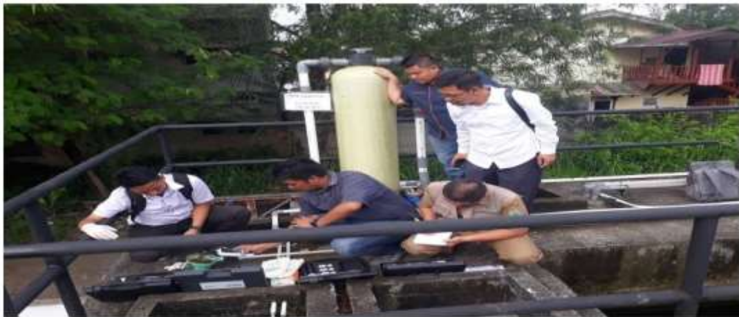
4b. Monitoring of wastewater quality at USU Hospital IPAL conducted by a third party, namely SUCOFINDO and inspection conducted by North Sumatra DLH