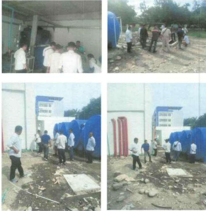
2. Monitoring of wastewater quality at STP Digital Learning Center Building in June 2023, namely SUCOFINDO