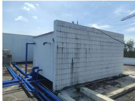
Rain harvesting in USU Information Study Centre