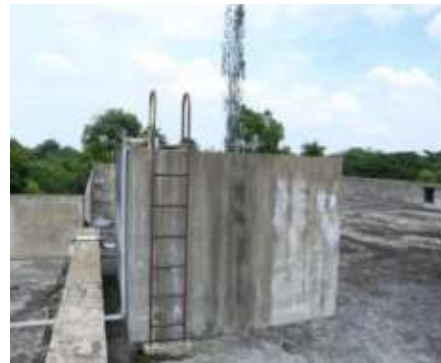
Rainwater Harvesting in Engineering Faculty