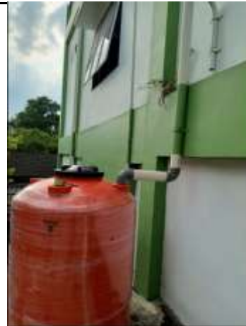
Reservoir of water used for ablution to be reused at the USU Faculty of Medicine