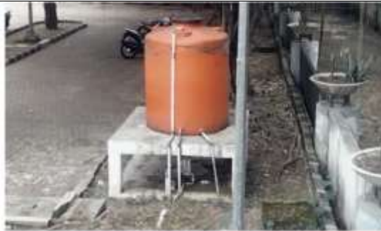
Recycle water for watering plants at USU Hospital