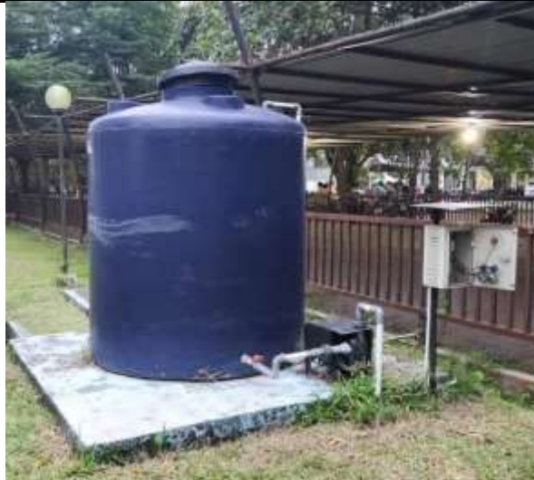
Rainwater Harvesting Near Administrative Building

University : Universitas Sumatera Utara Country : Indonesia Web Address : https://www.usu.ac.id