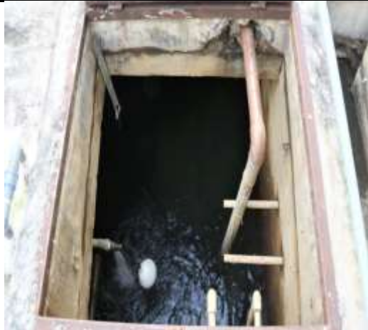
Water tank equipped with automatic float in Faculty of Public Health

University : Universitas Sumatera Utara Country : Indonesia Web Address : https://www.usu.ac.id