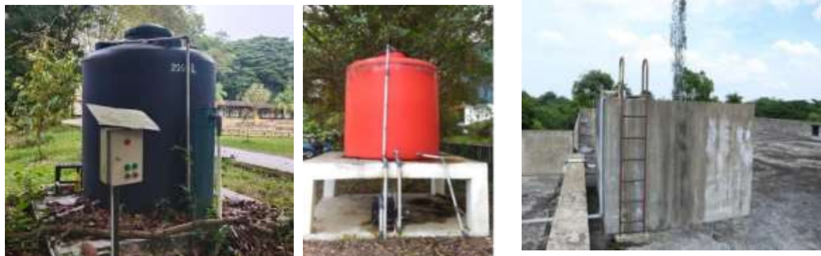
Rainwater Harvesting in Engineering Faculty