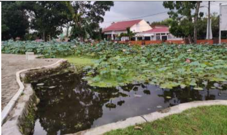
Infiltration Pool at the Faculty of Agriculture