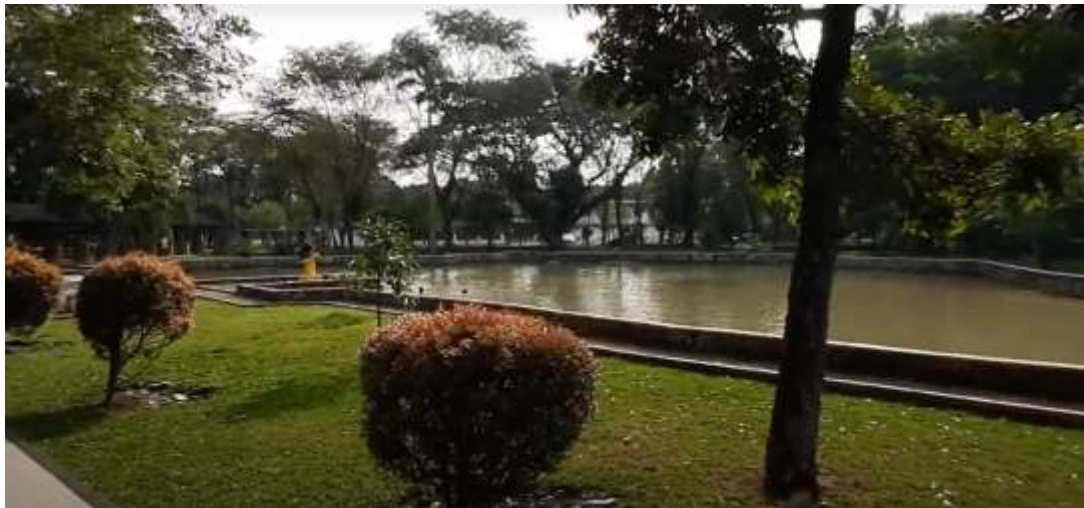
Infiltration Pool at USU Campus (near the Central Library)