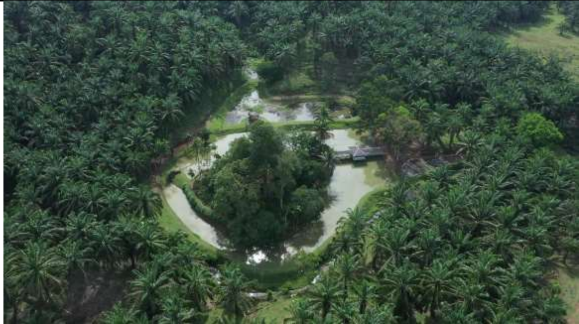
Infiltration Pool in the Tambunaan A Experimental Garden Area

University : Universitas Sumatera Utara Country : Indonesia Web Address : https://www.usu.ac.id